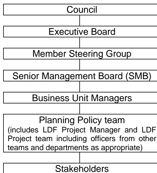
Figure 2: Management arrangements for LDD preparation